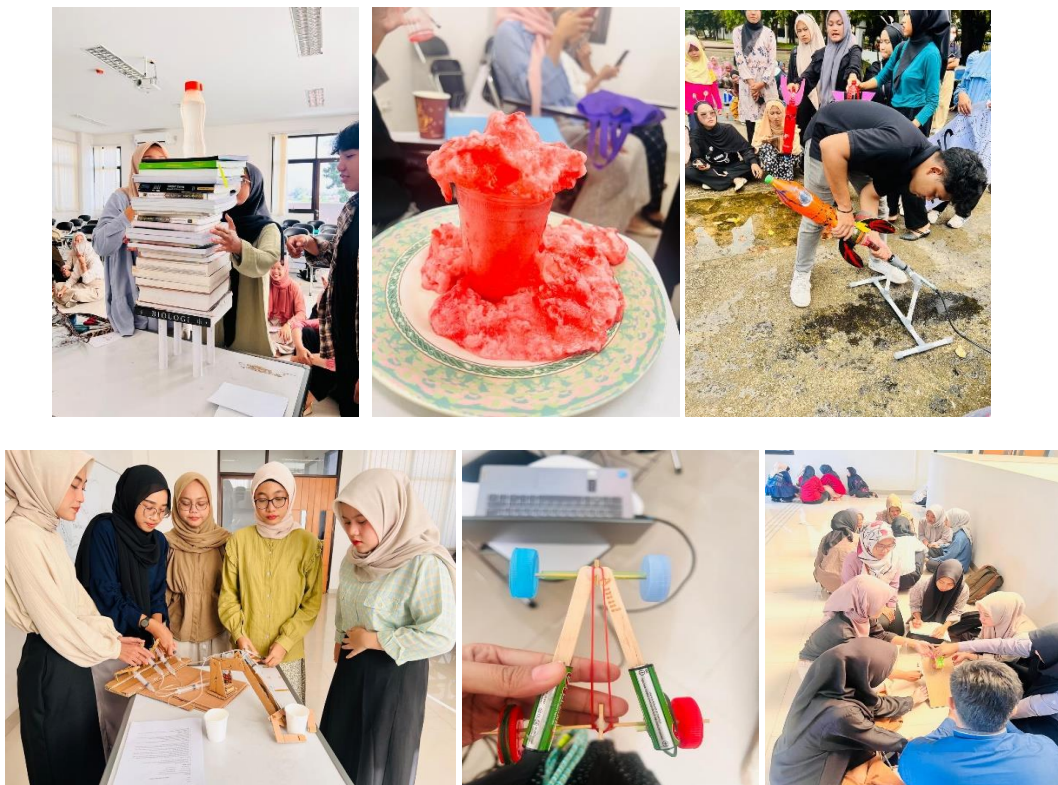
Figure 1. STEM Project Made by Prospective Elementary School Teachers

The pictures show the STEM instructional environment in the classroom, they also conducted practical work related to STEM, engaging in teaching simulations about the ideas and concepts they created.