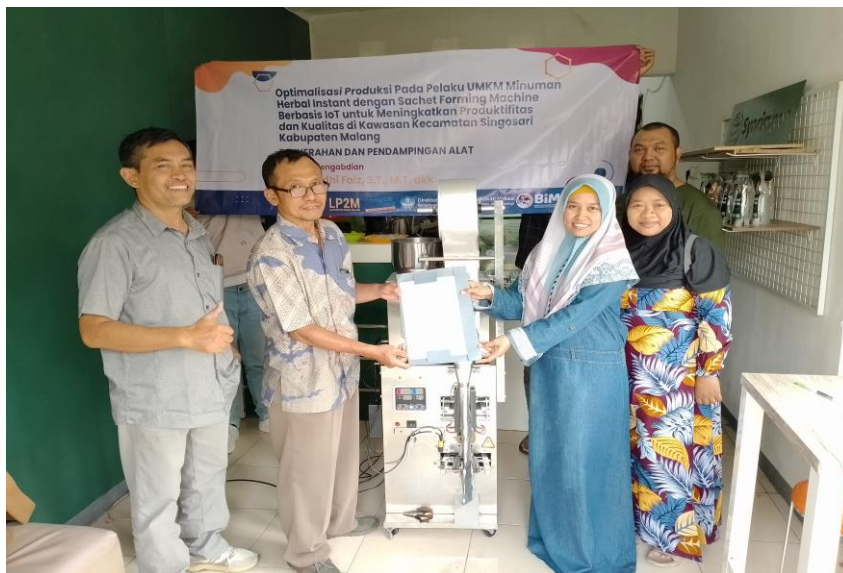
Figure 5 Handover of IoT-based Sachet Forming Machine

After discussing with the group of herbal drink business partners what had been explained and the need to resolve the problem by providing the right solution. By implementing an IoT-based Sachet Forming Machine, this machine is designed to carry out packaging reliably and can calculate the results of the packaging process automatically. So that when used it will be more efficient in the production process. This packaging process can be done automatically, quickly and accurately because it is no longer done manually and the presence of an automatic counter makes it easier to calculate the number of products that have been produced and can be monitored using the application to see product stock. better and can reduce the risk of errors in calculating the number of products so that it can increase efficiency and accuracy in business management and product availability.