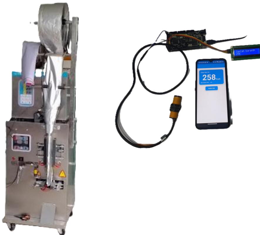
Figure 6 IoT-Based Sachet Forming Machine

This IoT-based Sachet Forming Machine is equipped with IoT (Internet of Things) technology to calculate the number of sachet packages produced and can monitor the number of packages that have been produced. Operators can also determine the quantity to be produced by setting the required value using the application contained in the system. This IoT-based Sachet Forming Machine is also equipped with an automatic feature that can stop operations that have reached the daily production limit and this IoT-based Sachet Forming Machine is also equipped with a manual system to stop the production process manually. This IoT-based Sachet Forming Machine is also connected to an internet connection so that business owners can monitor machines that are producing and can operate the system remotely as long as the system is connected to an internet connection so that MSMEs can gain greater profits and improve the quality of their products more effectively. and efficient.