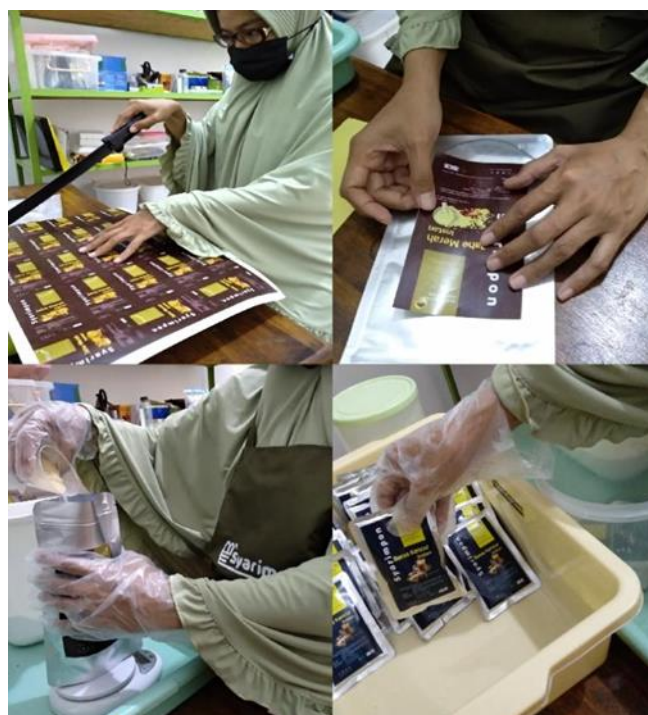
Figure 2 Packaging process for instant herbal drink products.

Based on the results of discussions and interviews with the two groups of MSME business owners in the Singosari area, the service team concluded the problems being faced by these partners: