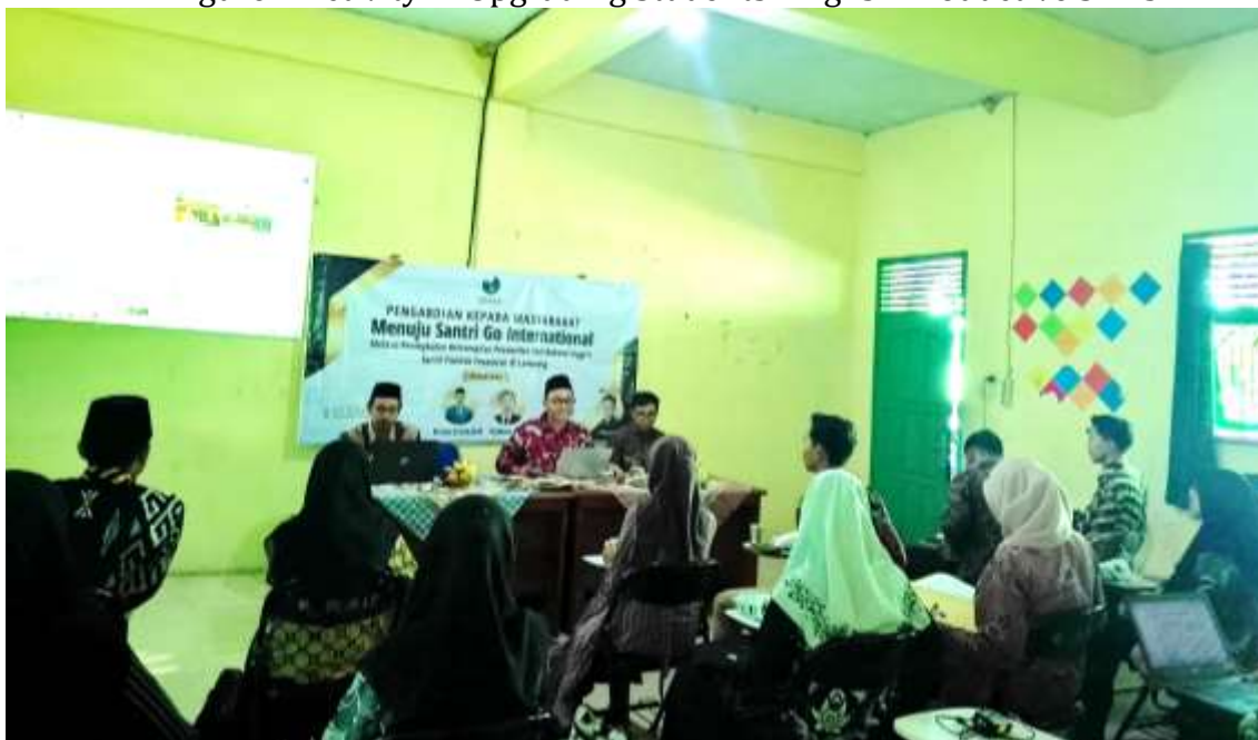
Figure 1 Activity in Upgrading Students' English Productive Skills