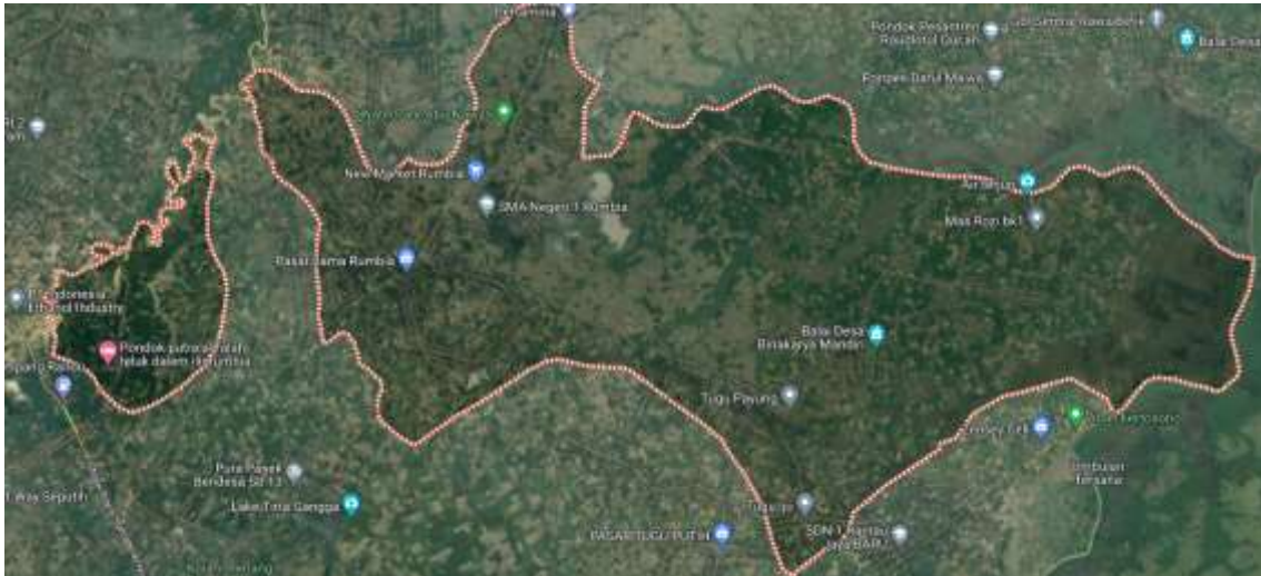
Figure 1 Location Map of Rukti Basuki Village, Kec. Rumbia Kab. Lampung Tengah

However, the farmers in Kampung Rukti Basuki have a problem difficulties in overcoming the level of soil fertility and eradicating weeds even though they have used many types of Chemical Products issued from the Manufacturer. In addition, the excessive use of chemical pesticides will cause pests and diseases to become resistant (Tandjung, 2003). The method of the farmers in Rukti Basuki Village is accustomed to using chemical products that are used to control parasites and pests that have a negative impact on their plants (Suwahyono, 2013). Even though they have used a lot of chemicals, pests and plant parasites that they plant still experience disturbances in their growth.