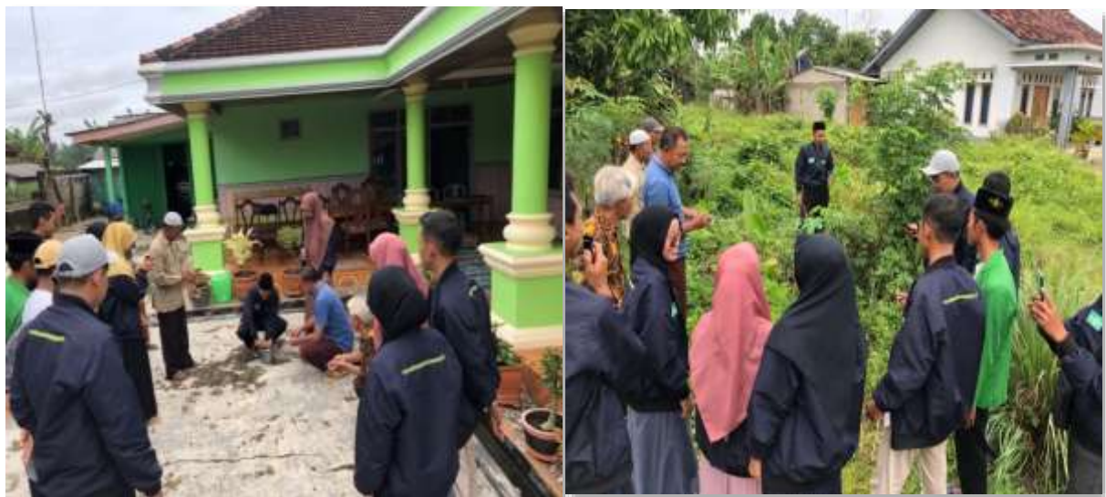
Figure 4 Demonstration of Organic Fertilizer Making (Environmentally Friendly)

After being given knowledge and skills in making organic (environmentally friendly) fertilizers, demonstrations and practices were carried out. As for some documentation of service activities can be seen in Figure 4.