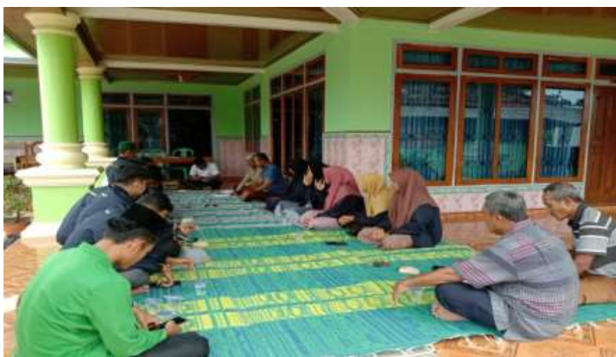
Figure 3 provision of material regarding materials used to make environmentally

This training activity was held for 1 day and included delivering material (lectures) and observing natural raw materials around us, then practicing them directly (Wijaya & Salis, 2022). On that day assistance was given to farmers. The material given to farmer groups includes the negative impacts of using factory-made chemical fertilizers on the surrounding environment, the advantages of liquid organic fertilizers and vegetable pesticides compared to factory-made chemical fertilizers from an economic and environmental perspective, the potential for utilizing natural materials and household waste used for manufacturing liquid organic fertilizers and vegetable pesticides and methods of fertilizing and spraying them.