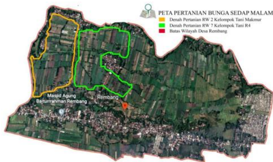
Figure 1 Site plan for agriculture in Rembang.

Despite the agricultural potential, a considerable portion of the community still lives in less prosperous conditions. During the COVID-19 pandemic, 170 households received the Village Direct Cash Assistance (BLT-DD) program due to their impoverished status. The average income of residents, particularly farmers in Rembang Village, is estimated to be below Rp. 1,820,000.00 per month, significantly lower than the Pasuruan Regency Minimum Wage as of December 2021, which was Rp. 4,354,787.17. This situation contributes to the overall lack of prosperity in Rembang Village.