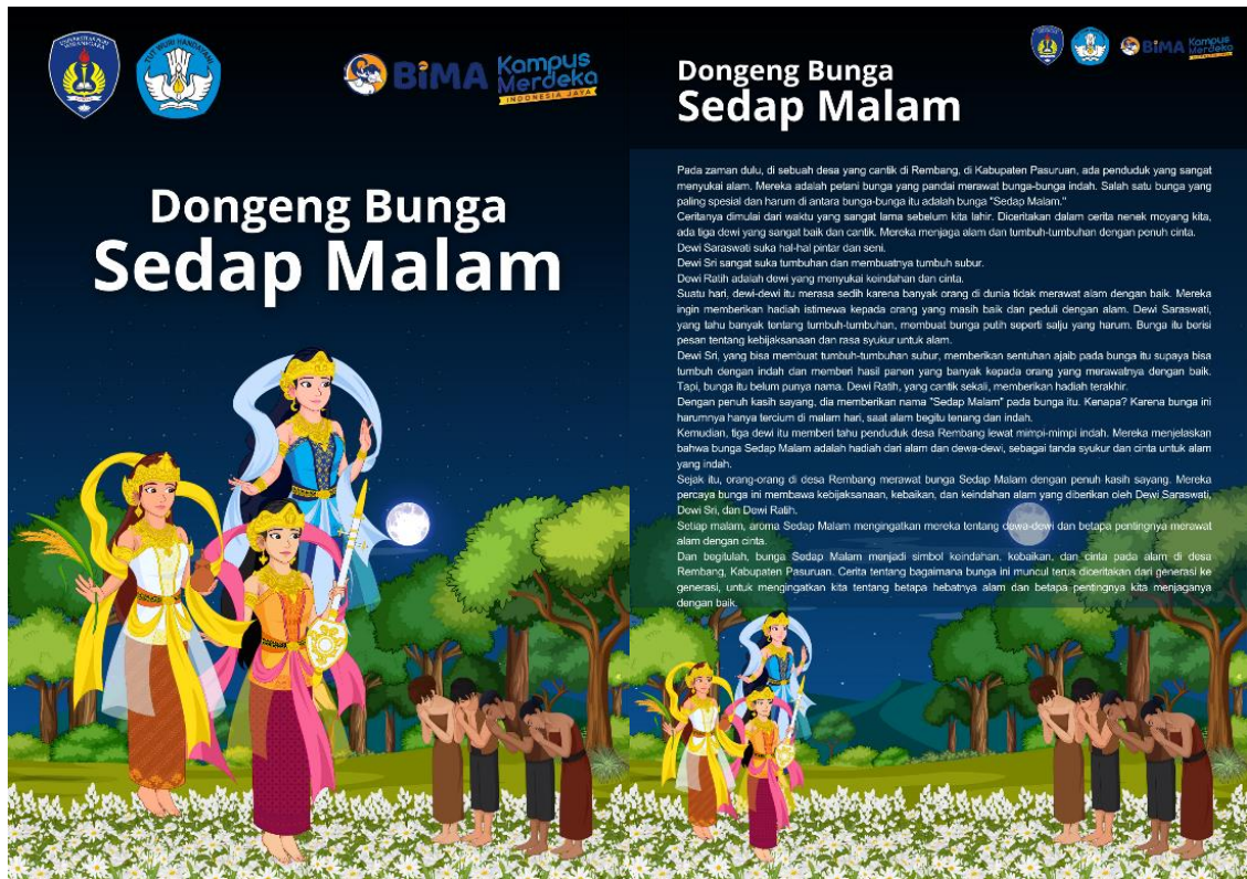
Figure 6 Tuberose Folktales

Here is the English translation of the Tuberose Folk Tale: