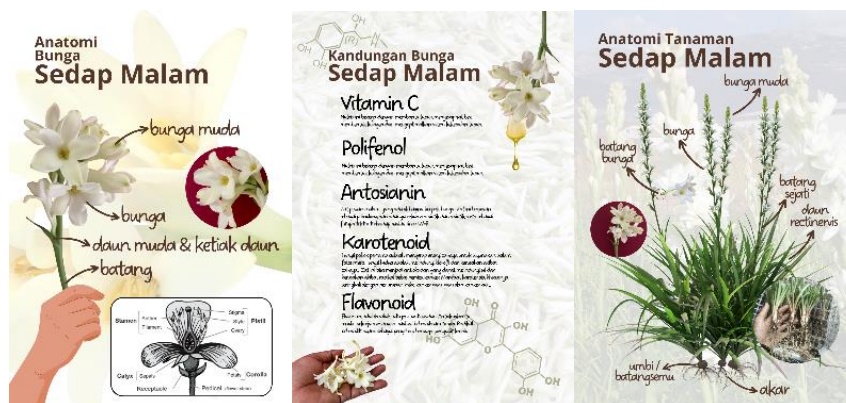
Figure 5 Tuberose Encyclopedia