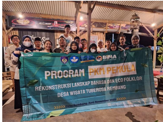
Figure 7 Activation and Sustainable Development Recommendations for the Educational Village