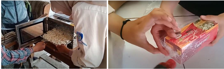
Figure 2 Training for the Production of Tuberose-Derived Products

Rembang Village, contributing to increased income for the community and a greater understanding of diversified processed products from agricultural produce.