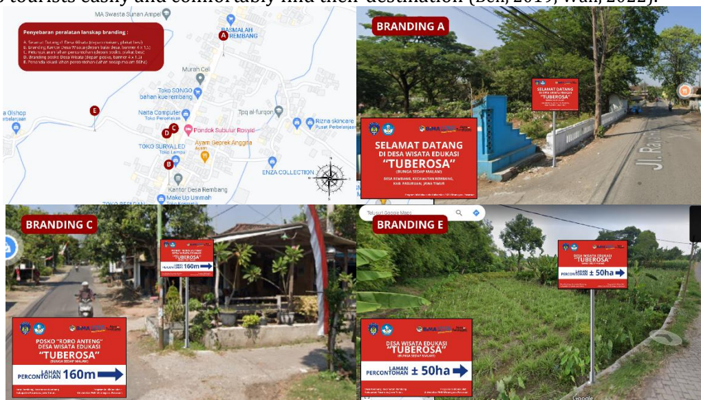
Figure 3 Landscape Branding: Directional Sign

In the development of a tourism village, landscape branding is a crucial aspect to consider. Landscape branding is an effort to create the identity and image of a tourism village through landscape elements such as spatial arrangement, architectural elements, and visual elements. One of the landscape branding products that can be developed in a tourism village is directional signs. Directional signs serve to provide information to tourists about the location of the tourism village, the information post location, and the location of the demonstration garden. Well-designed and informative directional signs can help tourists easily and comfortably find their destination (Bell, 2019; Wan, 2022).