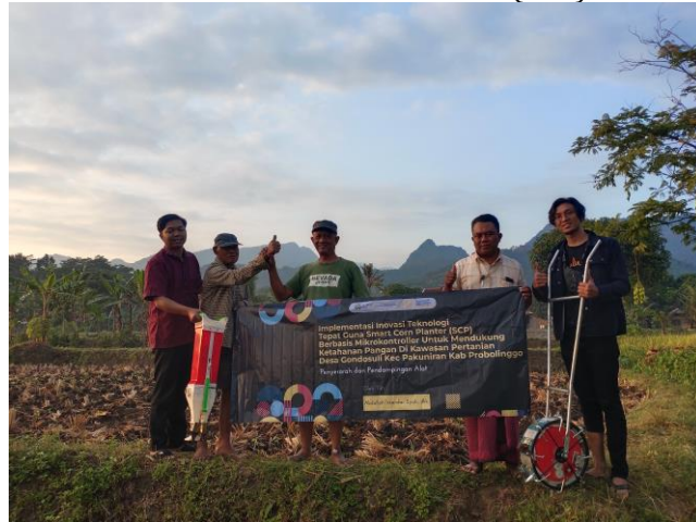
Figure 5. Handover of Smart Corn Planter (SCP) and Group Photo

The combination of modern technology and community involvement has the potential to have a significant impact on local food production, thereby bringing progress towards food self-sufficiency. As Gondosuli Village continues its journey towards increasing food security, this project serves as a model, highlighting the symbiotic relationship between technology adoption, community engagement, and sustainable agricultural practices.