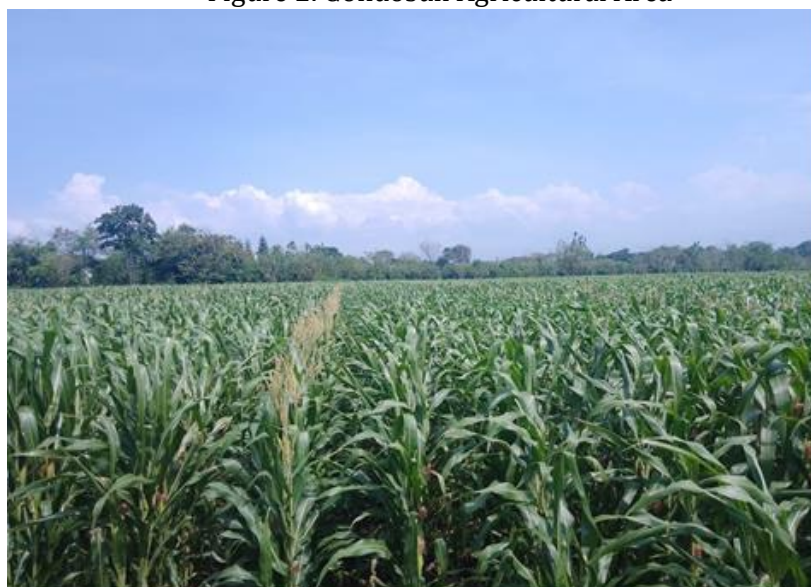
Figure 2. Gondosuli Agricultural Area

Observing this, productivity in the field of corn farming must continue to be developed due to increasing market demand, to make it easier for corn farmers to carry out the process of planting seeds and maximize the time for farmers to plant corn seeds to