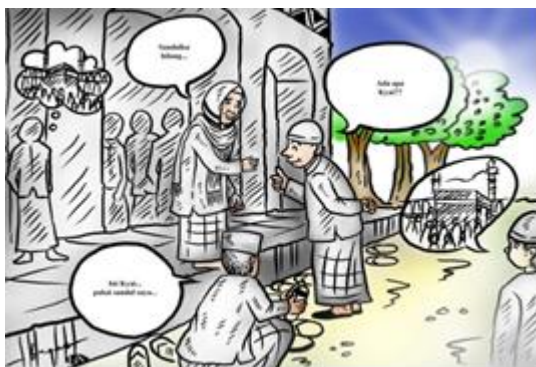
Figure 13. The pride of the Pasuruan community towards Kiai Hamid is shown through their respect for the figure of Kiai / Ulama

Stories and various forms that are now known as literature by the public are conveyed orally. These traditional stories can be in the form of legends, mottoes, fables, or other folk tales. Traditional literature learning in schools is directed primarily at the process of experience in literature. Students are invited to recognize the form and content of a literary work. Through this activity of knowing and familiarizing with literary creativity, it can foster understanding and respect for literary creativity as a beautiful and meaningful work. Learning traditional literature that will be able to develop a love for national culture. Nowadays, various traditional stories have been developed and recorded. Various stories come from regions in Indonesia and even from all over the world. This further adds to the love of students for Indonesian culture.