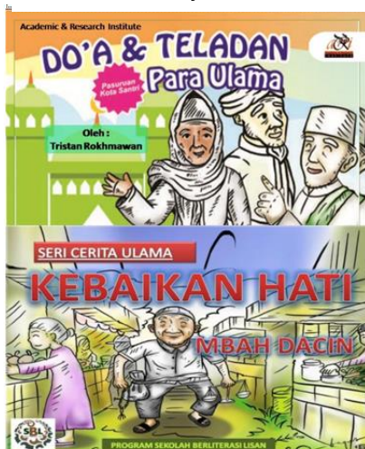
Figure 2. Some Books that Can be Used as Literacy Material

for this activity, the story book used as a model is a book entitled Do'a & Teladan Para Ulama : Kumpulan Kisah Didaktis dari Kehidupan Ulama Kota Pasuruan (Rokhmawan, 2020).