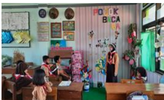
Figure 8. Cultivating students telling stories in front of the classroom to practice language skills

Before applying the storytelling method, educators are required to understand the content of the story to be conveyed, of course, it is adjusted to the age level of children in elementary school. The first thing that educators must do is choose the right theme. At elementary school age, children tend to like stories with the theme of adventure,