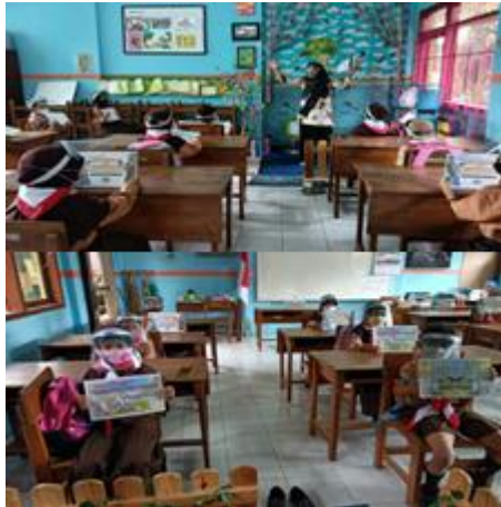
Figure 9. The teacher attracts students to show their skills and work, making them have courage

acceptance by his peers at school, motivation, and rewards such as praise or small gifts given to children for good things that have been done. Children's self-confidence can help complete tasks according to the stages of development, have the courage to improve self-achievement, become healthy and independent individuals. Contrary to this opinion, excessive self-confidence is not a positive trait because it will lead to a lack of caution and arbitrariness (Bandura, 1989;