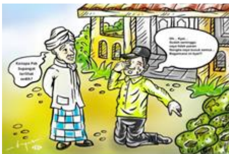
Figure 5. "Kiai Sepuh" advised the Jackfruit skipper who used to be stingy and is now having a hard time because the fruit is rotten (examples of good behavior and morality in stories)

able to teach students how to be polite according to good manners. Courtesy can start from behaviour, speech, and how to be calm and patient. The last is the aspect of responsibility, the importance of children having responsibility must start early so that children are trained on how to overcome their own problems. The small thing that children can apply from the lesson about responsibility is that children are able to do homework independently, wear shoes and dress themselves without the help of their parents.