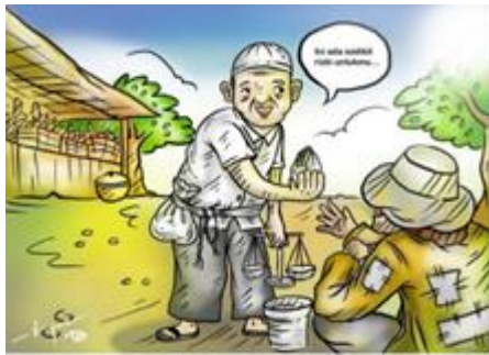
Figure 4. Mbah Dacin Shares the Sustenance after Every Trade (examples of good behavior and morality in stories)

religious values, social values, cultural values, and so on." (Hidayat, 2005; Syamsudin, 1990)