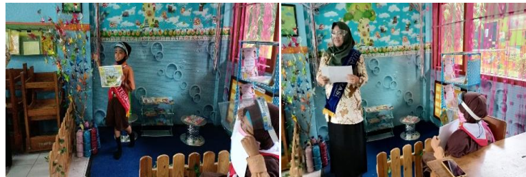
Figure 3. Assignment and Performance of Teachers and Students

3) The performance is done by displaying narrative prose stories that have been developed by the teacher based on story material collected by students. The teacher initially reads the story in front of the class. The rest of the students were asked to take turns reading stories that had been developed by the teacher. Gradually every time teachers and students will get used to developing a culture of oral storytelling in the classroom.