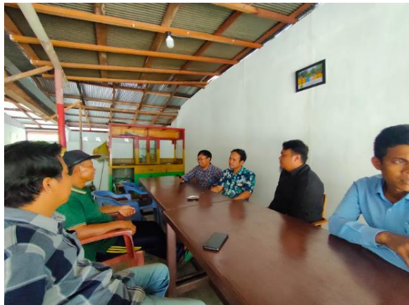
Figure 1. Casual discussion as an effort to socialize and educate partners

increased the sense of ownership of the technology to be implemented, which is important for long-term success.