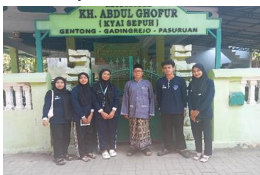
Figure 3. The KKN team met the caretaker and discussed the history of Kyai Sepuh