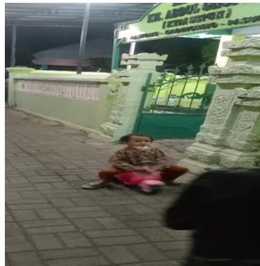
Figure 2. A child playing in front of the Tomb.

The impact of this problem is not only on cultural aspects, but also on the potential of the local economy. Religious and cultural tourism, such as those centered on the Tomb of Kiai Sepuh, has great potential to attract visitors and provide economic benefits to the surrounding community. However, if interest in this site continues to decline, then this economic potential will also be lost. Gentong village could miss out on opportunities to develop culture-based tourism that not only strengthens the local economy but also preserves cultural heritage. Therefore, the revitalization of The Legend of Kiai Sepuh and his grave site is very important, both to maintain the continuity of cultural heritage and to maximize the economic potential that can be generated from religious tourism. Identification of this problem does not arise out of nowhere, but through a series of observations and discussions with various related parties in Gentong Village. In the initial observation, it is clear that although the tomb site of Kiai Sepuh is still visited, the number of visitors tends to decrease, especially from among the young. In addition, not many students of Sdn Gentong know The Legend of Kiai Sepuh well, and only a few of them have ever visited the Tomb. The results of discussions with the Tomb managers and the local community also expressed their concern for the future of this site, if there is no significant effort to revive the interest and attention of the community.