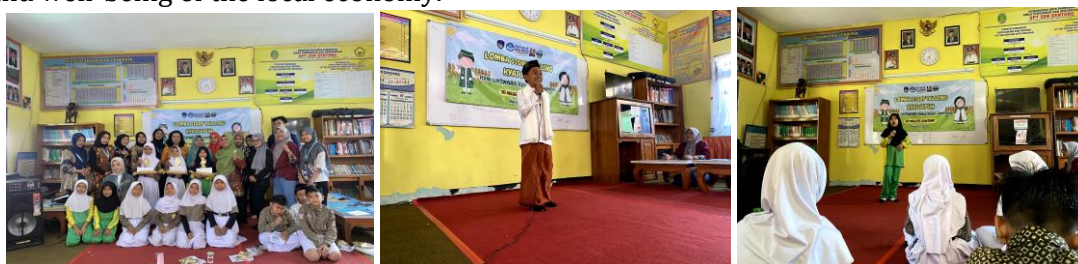
Figure 5. Participants appear in the event of storytelling stories Kiai Sepuh

Legend Festival Kiai Sepuh will be held as the culmination of a series of activities, with oral storytelling competition as one of the main events. The Festival aims to promote and revive the tradition of storytelling, involving students of Sdn Gentong and the general public. Through this competition, it is hoped that interest in local stories can reappear, and the younger generation can learn to express and spread these legends. The Festival also aims to attract media attention and visitors, improving the image of Gentong village as a religious and cultural tourist destination. Overall, this activity is expected to resurrect people's memories of The Legend of Kiai Sepuh, preserve tomb sites, and integrate cultural heritage into people's lives and school environments, while increasing awareness and well-being of the local economy.