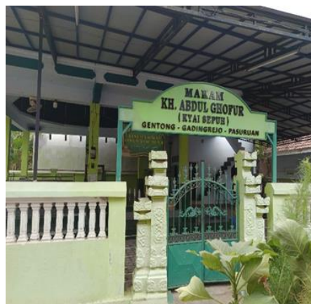
Figure 1. Tomb Of Kiai Sepuh (Front View)

The Tomb of Kiai Sepuh, as an important religious site, now faces difficulties in maintaining its position as a respected place of pilgrimage. Tomb managers feel a growing sense of responsibility to keep the site attractive and sustainable, especially as support from the community begins to wane. This condition is compounded by the lack of involvement of the younger generation, especially students at Sdn Gentong, in activities related to local cultural heritage. In the midst of the rapid flow of popular and modern culture, their interest in local stories such as The Legend of Kiai Sepuh is decreasing, resulting in them becoming increasingly alienated from their own cultural identity (Rokhmawan & Firmansyah, 2018; Salimuddin, 2020; Tristan Rokhmawan, 2019).