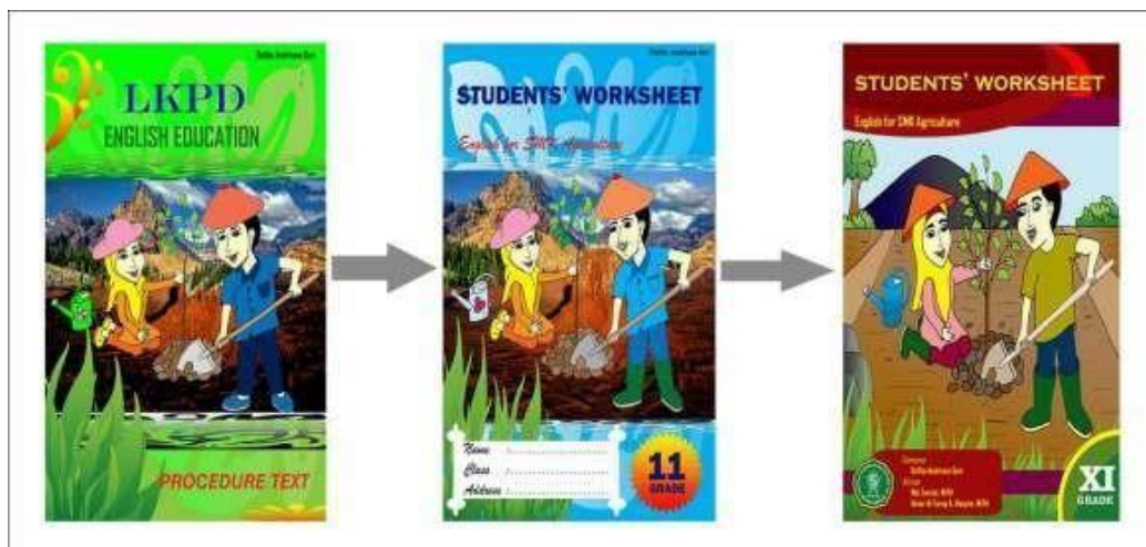
Figure 4 Cover Design of Students' Worksheet Based Educational Comic before and after Revise