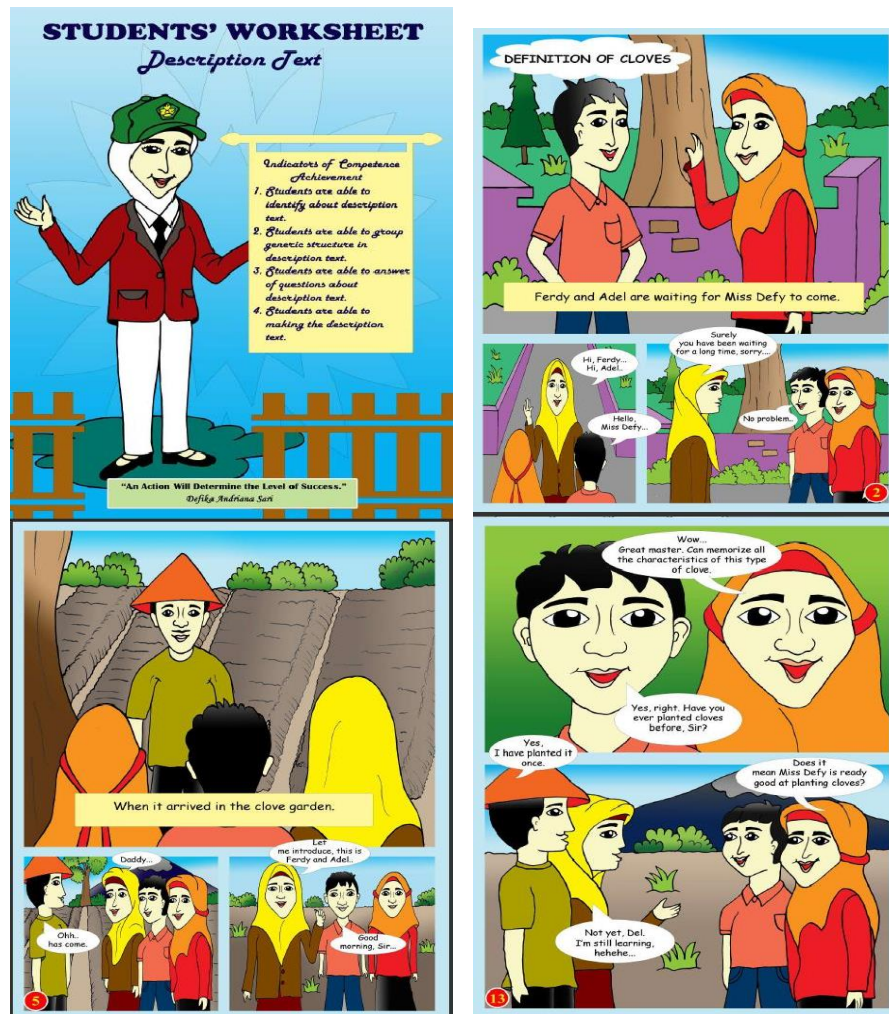
Figure 2 Educational Comic Story of Students' Worksheet Based Educational Comic

The educational comic story, there are lots of panels on each sheet, it doesn't look like the image looks interesting. The material therein is only procedure text