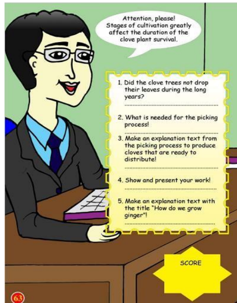
Figure 5 Exercises of Students' Worksheet Based Educational Comic

At the end of the Students' Worksheet section, it is planned to arrange question exercises containing questions that can determine the extent to which the contents of educational comic stories that students have understood. Isnaini Nur Azizah, M.Pd said that "The form of questions must be in accordance with the material as well as components of the learning method." The practice page for the Students 'Worksheet can be seen in the following picture