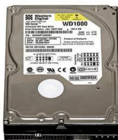
Figure 2. The ATA type hard drive