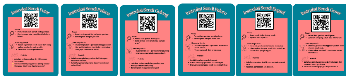
Figure 3. Back view of the STAR Quartet Card Human Motion Joint