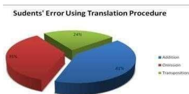
Figure 6. Percentage of student's making error in using the translation procedure

The figure below was the describing of the students who made error in using the translation procedure at the fourth semester students of English Education Study Programme of IAIM NU Metro Lampung.